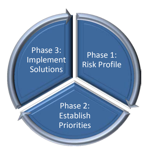
NIST Framework Implementation Guidance Cycle

The main objective of the Implementation Guidance is to strengthen an organization's risk management approach and communicate its use of cybersecurity practices to internal and external stakeholders. As stated previously, this guidance was designed to be used by organizations of varying levels of cybersecurity and risk management maturity. The following diagram illustrates the approach that the TSS is using to assist organizations with their implementation efforts.